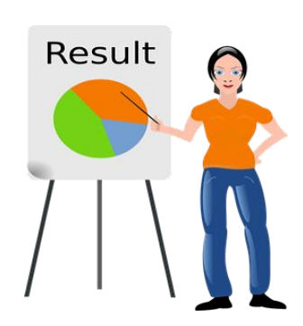
9 research posters